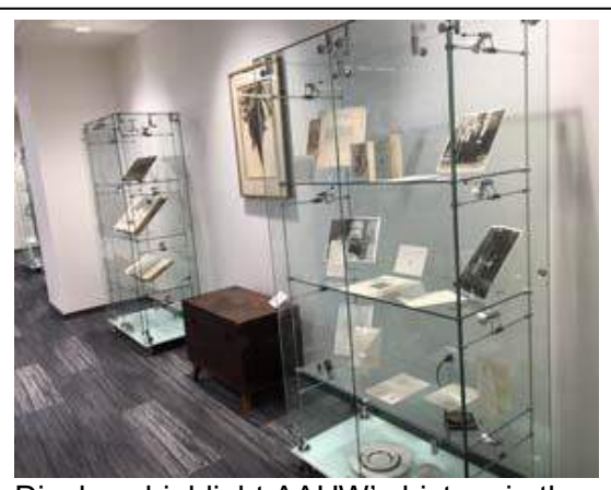
Displays highlight AAUW's history in three former DC buildings. Wooden trunk was AAUW's first (traveling)