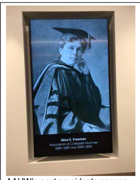
AAUW's past presidents appear one by one on this video screen