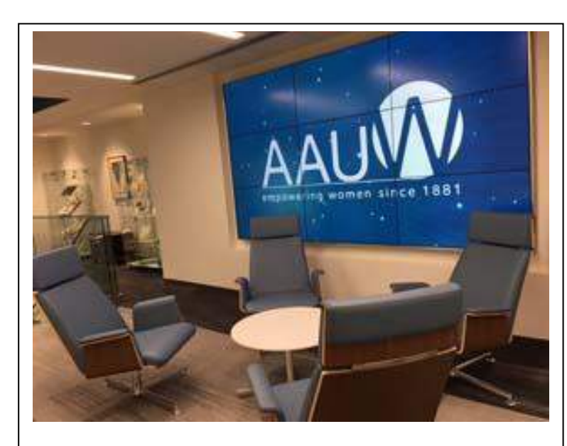
Reception Area, 10<sup>th</sup> floor Logo screen's colors and patterns evolve