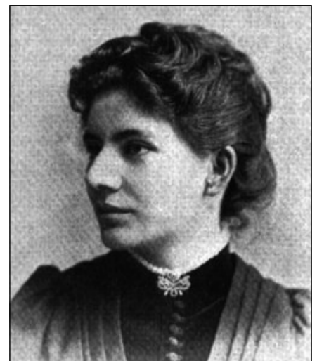
Sophia Hayden.